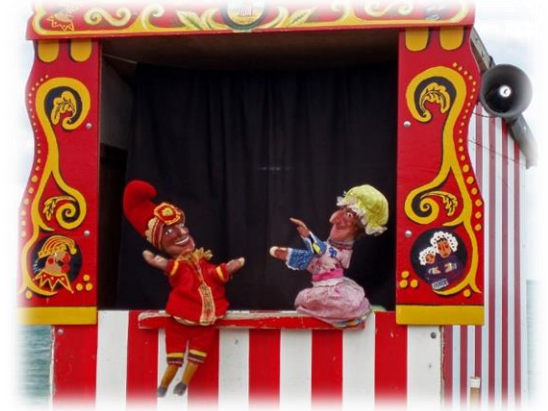
Puppetry (Nottingham Trent)