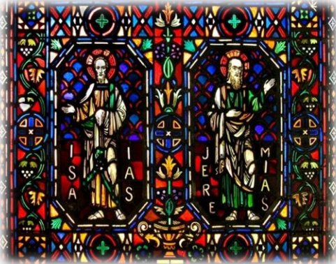
Stained Glass (York)