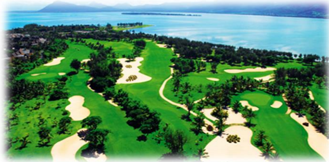
Golf course management (Birmingham)